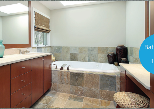
Bathrooms & Toilets